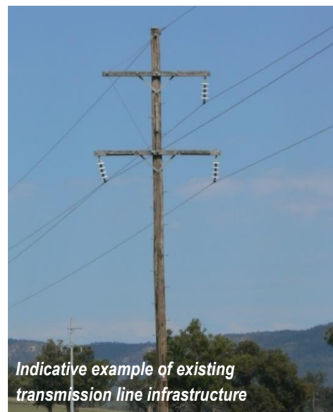
Indicative example of existing transmission line infrastructure

Landholders whose properties contain transmission line infrastructure to be upgraded will be requested to provide access to allow surveyors, engineers and construction crews to undertake site inspection and upgrade activities. Land access arrangements will be negotiated with affected landholders well in advance of the upgrade activities commencing. Where possible, landholders' preferred access periods and arrangements will be taken into consideration when scheduling construction activities. Landholders with properties adjacent to the easement will also be directly consulted to ensure they are aware of the proposed works and any potential impact on their existing amenity.