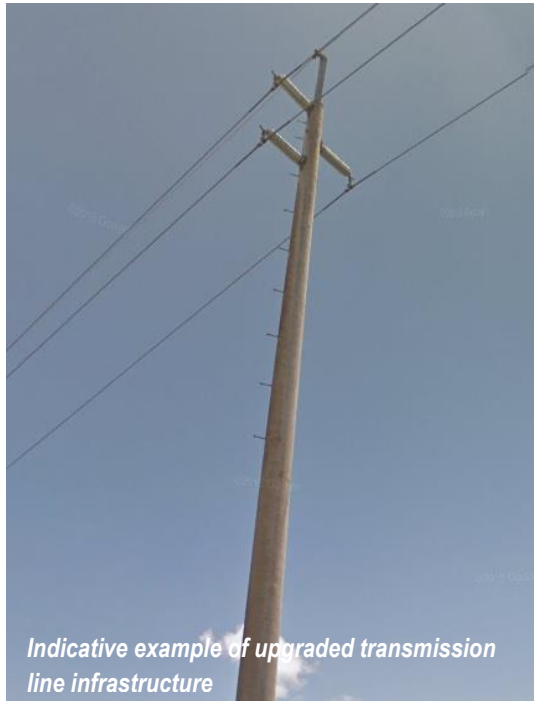
Indicative example of upgraded transmission line infrastructure